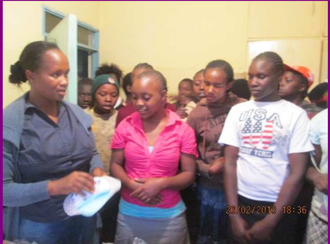
Well– Wisher Donating sanitary Towel to The Girls